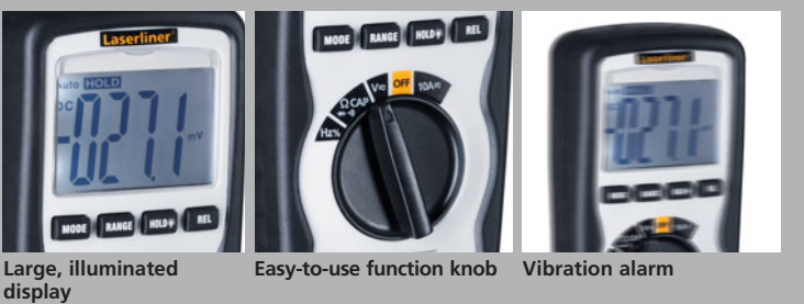
Large, illuminated display