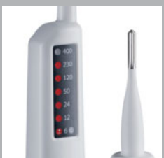
High contrast LED indicator