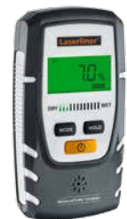
MoistureFinder Compact + battery Packing dimension (W x H x D) –