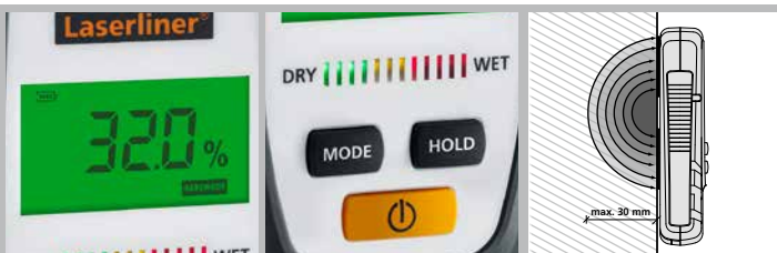
Large, clear LCD